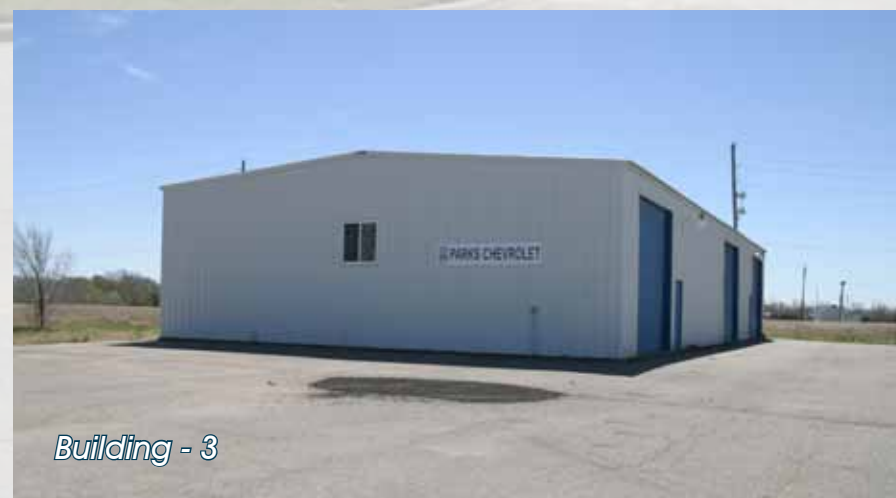
Building - 3