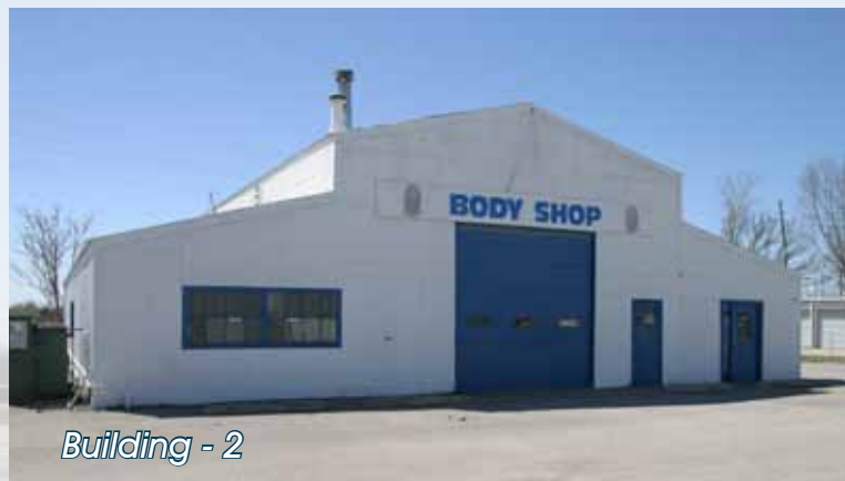
Building - 2