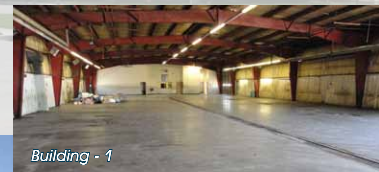
Building - 1