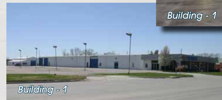
Building - 1

For Information Contact: Dan Unruh / Curt Robertson (316) 618-1100